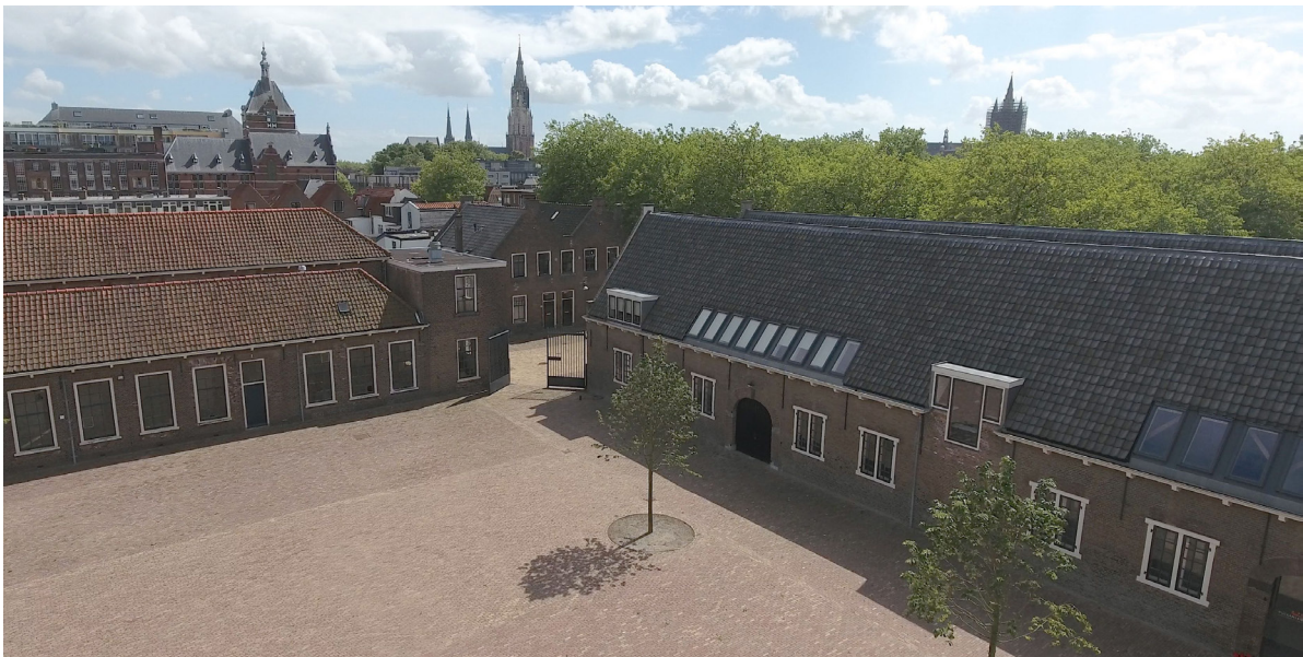
1. Figure - office building

zepp.solutions is a young company that develops application specific hydrogen fuel cell systems. Hydrogen fuel cell systems offer a clean alternative to conventional diesel engines in a whole range of mobile applications or other high power demand applications without any drawbacks on uptime, cost or lifetime.