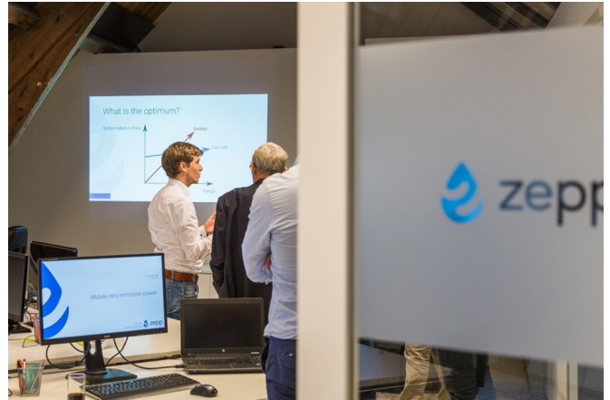
2. Figure - zepp.solutions office

One of the requirements from IEC 61508 SIL 2 is to achieve 100% decision coverage. In order to verify this requirement, the coverage needs to be measured. We chose for Testwell CTC++ to do the job.