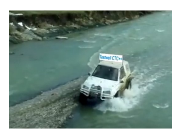
Figure 2: Testwell CTC++ Test Coverage Analyser is often compared to an off-road vehicle: the tool always works reliably - even in difficult "terrain"...

Some coverage tools get problems when analyzing language constructs that deviate from common standards or have a high nesting depth. However, a good tool for measuring test coverage should also be able to cope with a "creative" programming style.